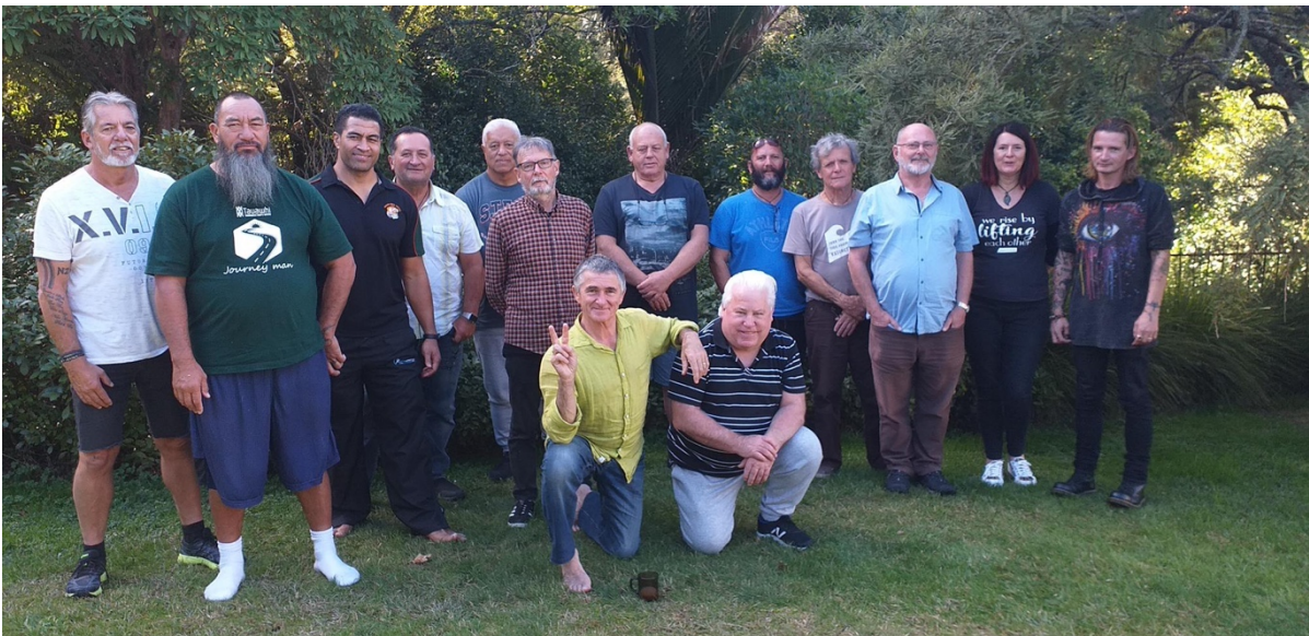
The Hosting Peer Support Groups Team @ Bella Rahka Centre in Auckland.