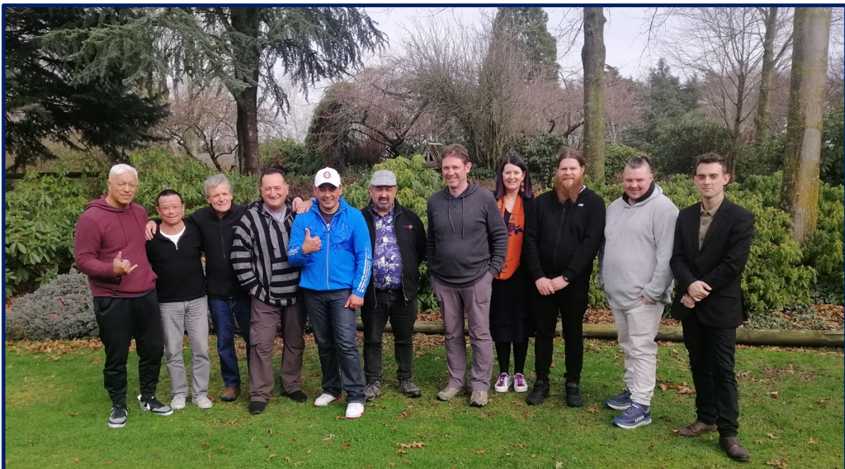
The IPS Team @ Oxford, Canterbury

Since launching our education and training program in 2019, MSA have trained more than 70 peer workers including several professionals and collaborators that support our work.